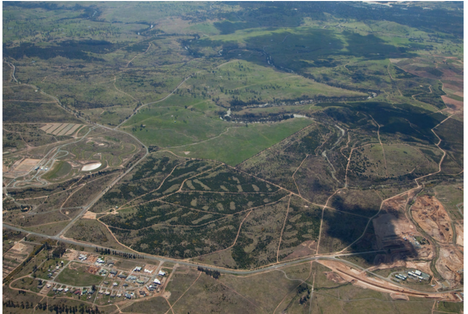
Aerial image of Molonglo Valley September 2010.